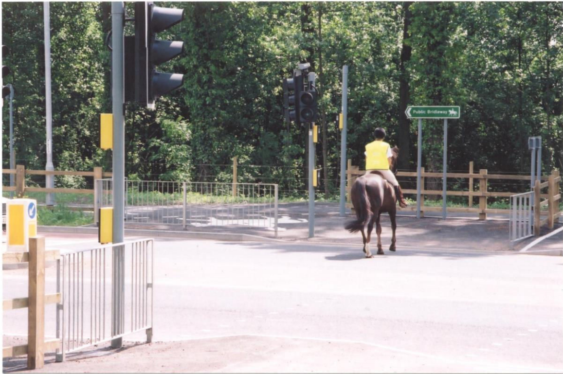
Photo: A Pegasus crossing.

As with cyclists and pedestrians, usage can be split into those who need to cross Highways England's network and those who need to travel along it. A top priority for horse riders is to improve the ability to cross busy carriageways and their preferred option is to use a Pegasus crossing because the controls are higher and they can stay mounted. These user-operated crossings allow horse riders to cross safely because traffic lights stop vehicles, helping to keep the horse calm.