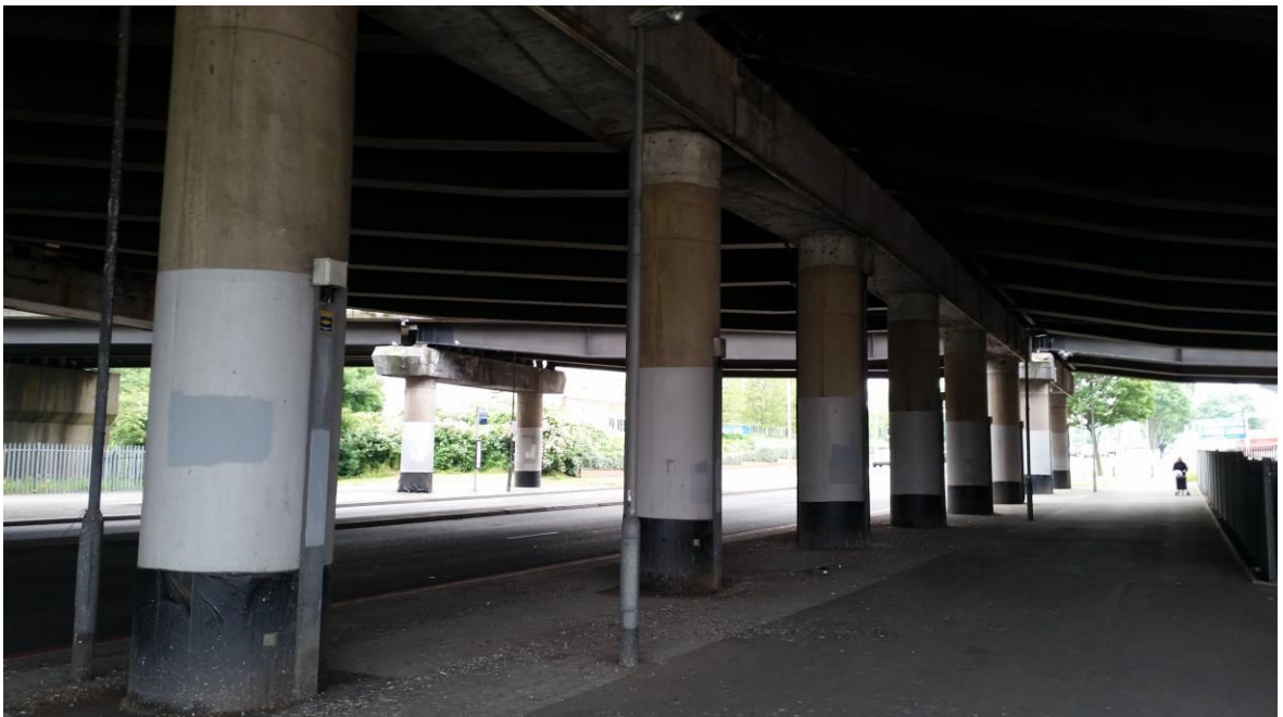
Photo: Pigeon defecation on footpaths under bridges, as seen here under the M5 at Oldbury.