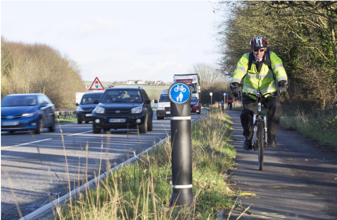
Photo: Cycling on a segregated path.

We were told that the quality of cycling infrastructure is of key importance in maintaining current usage and in encouraging more cycling. As well as surface quality, other aspirations include shielding cyclists from excessive traffic noise; signage improvements; prevention of flooding; and improved links with other cycling routes. The latter should include close cooperation with local authorities to maximise connectivity.